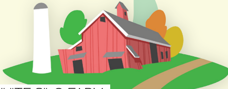
WHITE SILO FARM

"Helping you discover your Fairfield County journey!"